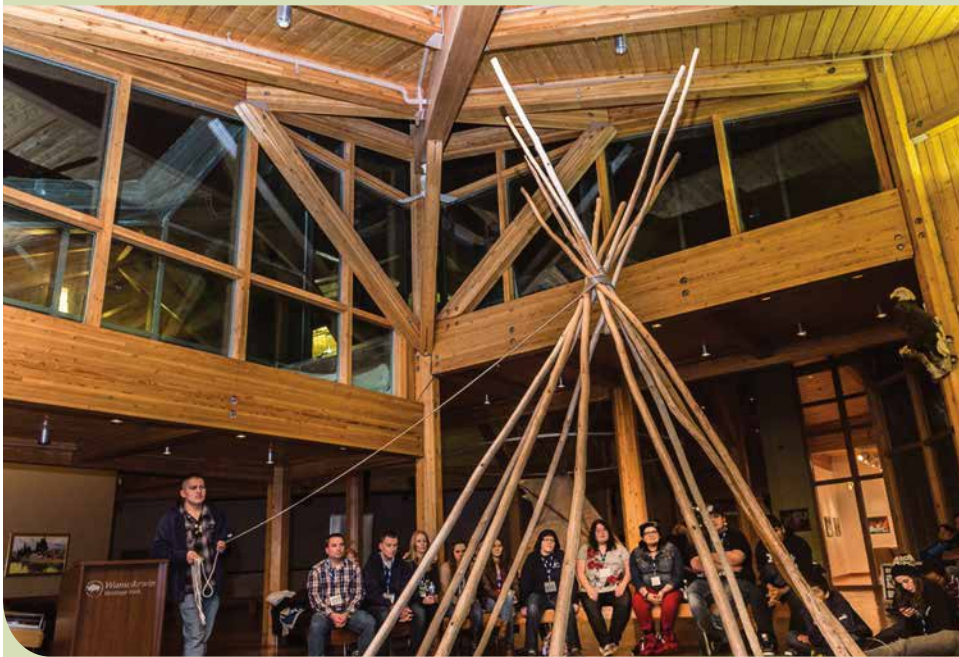
Aboriginal youth came together to recognize Aboriginal accomplishments and meet Indspire award winners.

There is an Aboriginal saying that education is the new buffalo. In the past, the buffalo provided the food, shelter, clothing and other needs for Aboriginal communities. Today, education is seen as providing that community need. On March 15 and 16, this message was repeated throughout Indspire's first National Gathering for Indigenous Education.