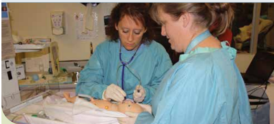
Patient simulation demonstration during a tour of the Pediatric Clinical Learning and Development Centre.

"The Hall of Fame shines a light on those individuals, and their knowledge has a lasting impact that is shared through Junior Achievement."