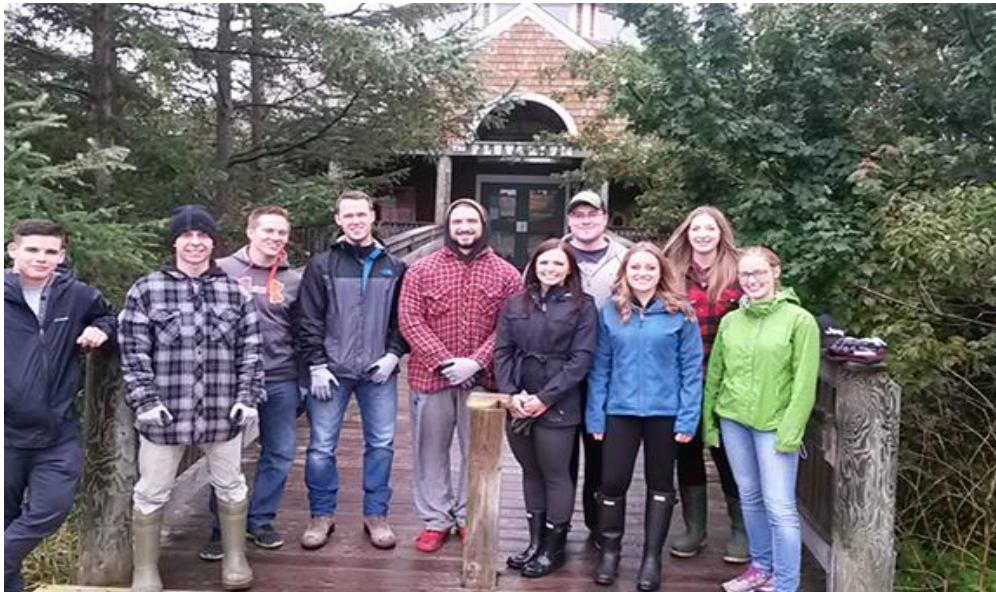
Figure 2 - Co-op students participating in Days of Caring at the Suncor Energy Fluvarium

Suncor and Terra Nova Contractors continue to support co-operative education programs offered through local university and technical institutions with interesting and challenging work opportunities in various functions of our businesses such as engineering, geosciences, finance, supply chain management, and marine roles. In 2015, the Terra Nova Project filled a total of 97 Co-op positions at a cost of over $1.3 million. The Co-op program has been quite successful in helping Suncor and Terra Nova contractors identify long-term hires needed to support the labour requirements of the Terra Nova project.