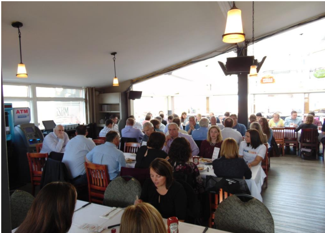
Figure 4 - The 2015 United Way Kick-Off Breakfast