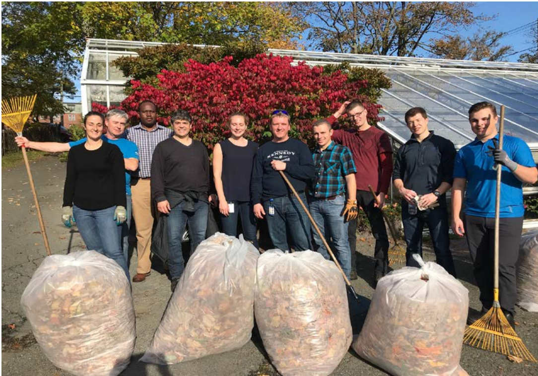
Figure 3 – Bowering Park Clean-up – Day of Caring