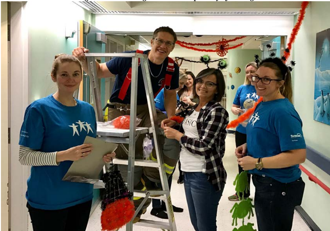
Figure 4 – Decorating the Janeway for Halloween