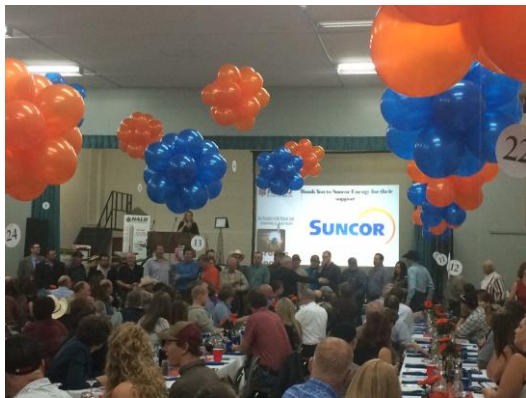
Suncor was the Bronze sponsor of the 2016 HALO Fundraiser