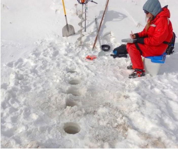
Ice-Thickness Monitoring (Golder-WSP)