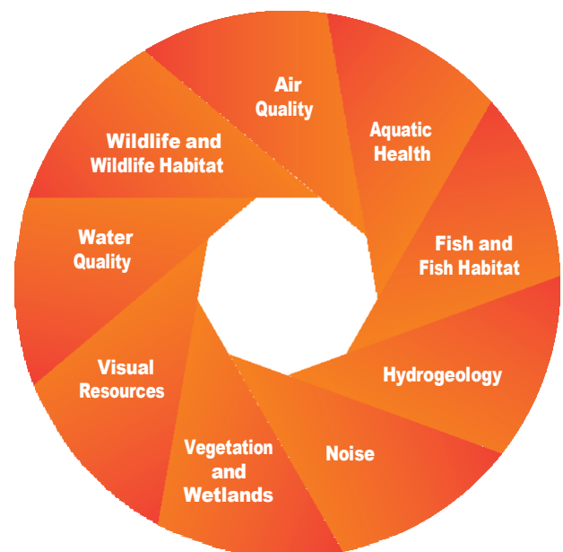
Figure 3. Baseline Field Survey Disciplines for the Proposed Base Mine Extension Project