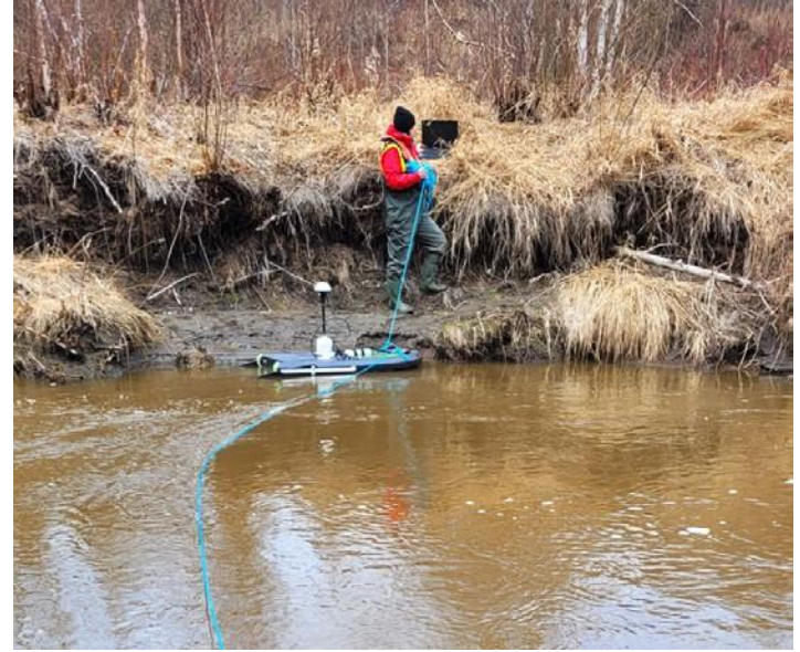
Streamflow Monitoring (Golder-WSP)