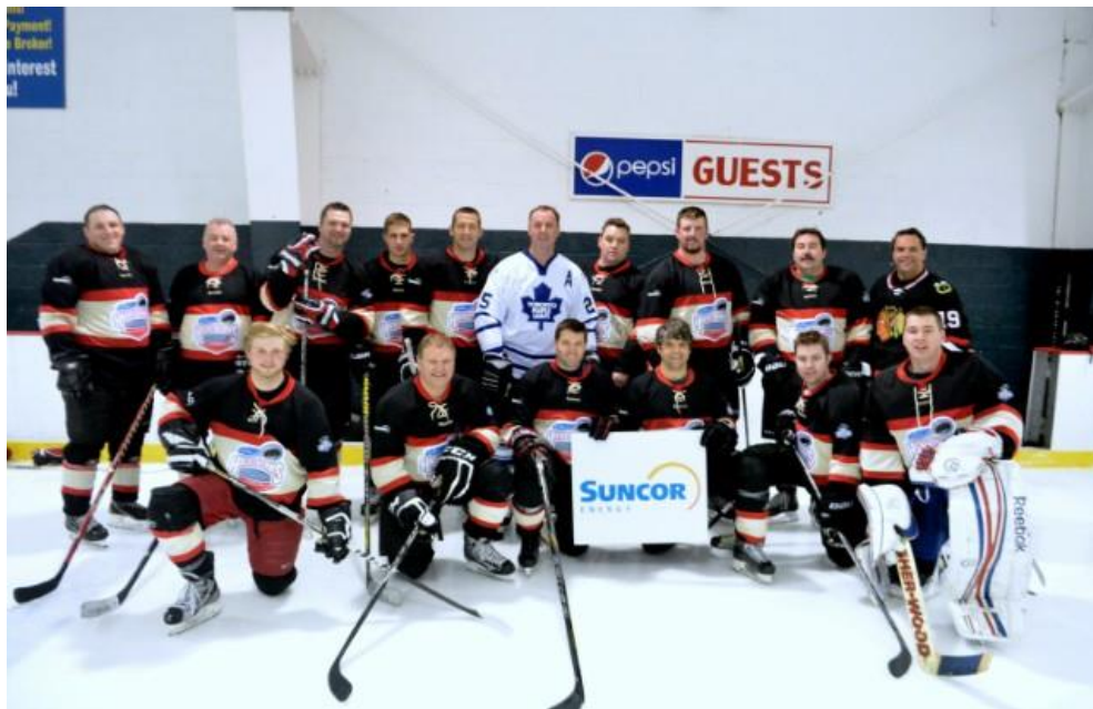
Figure 3- Heart & Stroke Foundation Hockey Heroes Tournament – Suncor Team