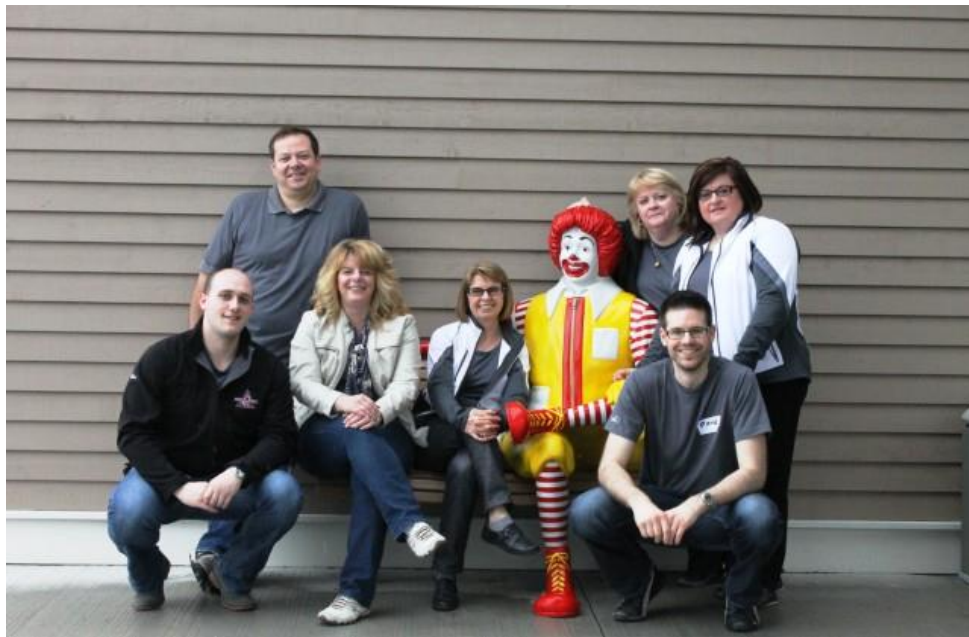
Figure 2- Days of Caring – Ronald McDonald House